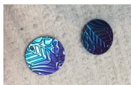
More lentil beads created in Maureen's June program