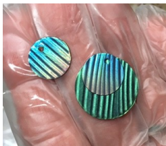
Anodizing reactive metals during the July program

Many members would like more info! Please contact me if you are willing to share at sherri.stauffer@yahoo.com .