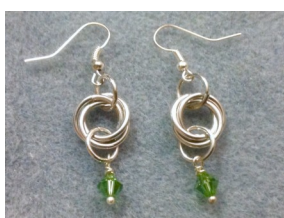
MÖBIUS EARRINGS with Swarovski crystals

If you have ever wanted to try chainmaille, but have been intimidated by all those little rings...here is your chance. These earrings are a great beginner's project. You will learn the proper way to open and close jump rings and how to make a Möbius ring. By combining them and adding a bit of sparkle with Swarovski crystals, you'll have a cute pair of earrings to wear anywhere.